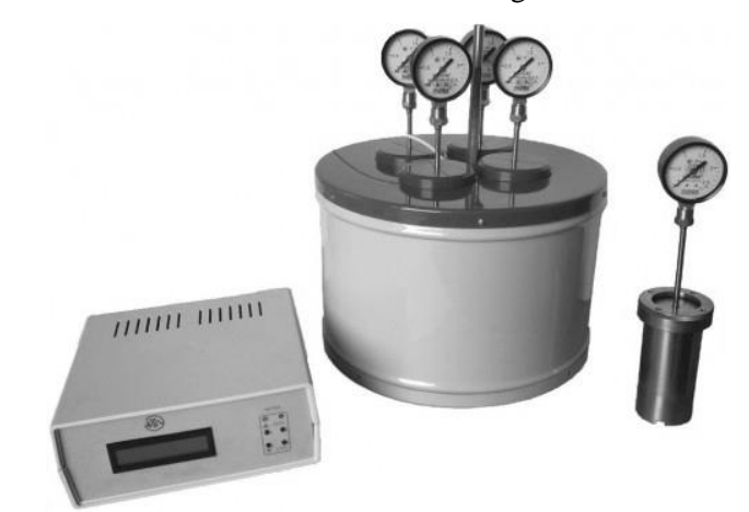
Fig. 2. Device for studying the oxidative stability of fuels and lubricants TCPT-2M

The experiments were performed in accordance with GOST 11802 to evaluate the effect of fullerene C_{60} on the antioxidant properties of fuels and lubricants. The scheme of the device is shown in Fig. 2.