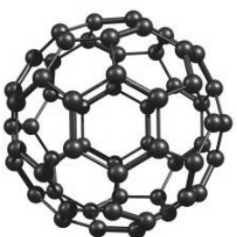
Fig. 1. Fullerene molecula C<sub>60</sub>

Fullerenes have unique chemical properties. Their molecules are made up of five- and hexagonal fragments. The pentagons are absent in the layer structure of the graphite and they ensure the closure of the fullerenes structure. Fullerene C_{60} is the least stable and the most available of the fullerenes. The C_{60} molecule belongs to the icosahedron group and is a polygon which resembles a football of the type made of hexagons and pentagons, with a carbon atom at the corners of each hexagon and a bond along each edge.