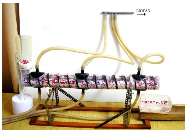
Fig.2. Demonstration model of continuously working screw methane-tank

To demonstrate possible appearance of the proposed methane-tank design concept there was assembled its demonstration model by the authors of the article (fig.2).