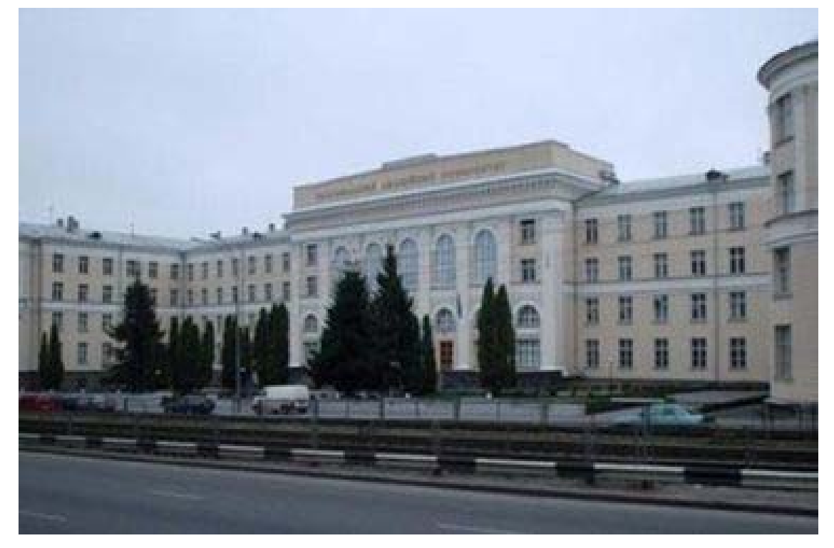
Fig. 2. General view of the first building of NAU