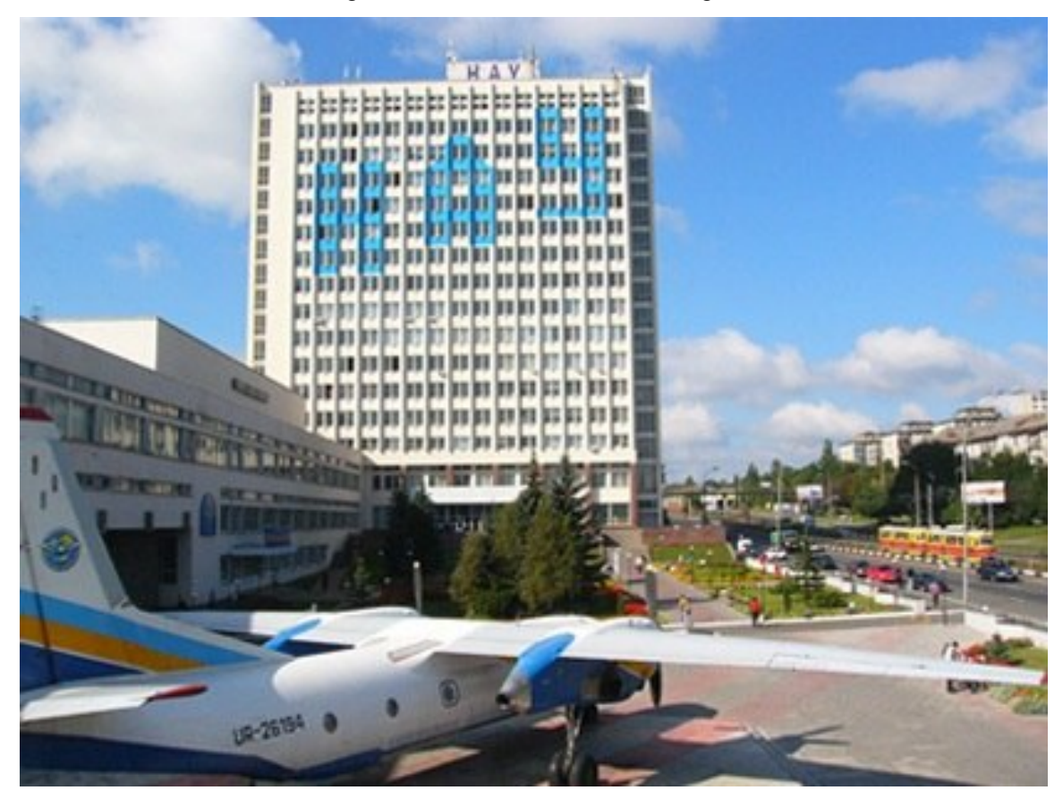
Fig. 3. General view of the building 8 of NAU