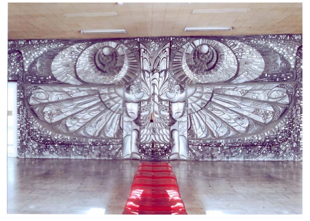
Fig. 5. The large panel in the library