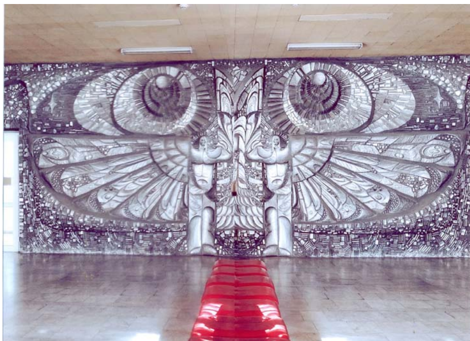
Fig. 5. The large panel in the library