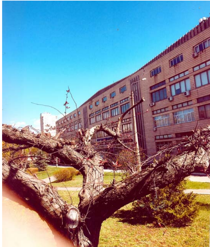
Fig. 4. Decorative composition near the educational building