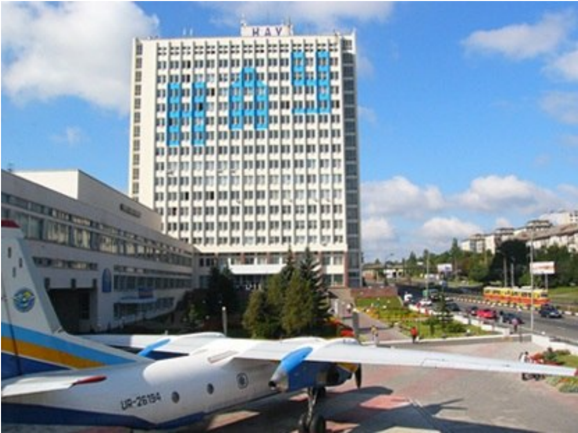
Fig. 3. General view of the building 8 of NAU