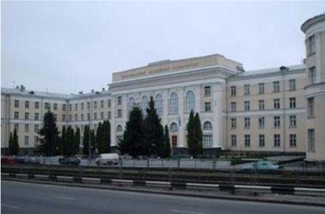
Fig. 2. General view of the first building of NAU