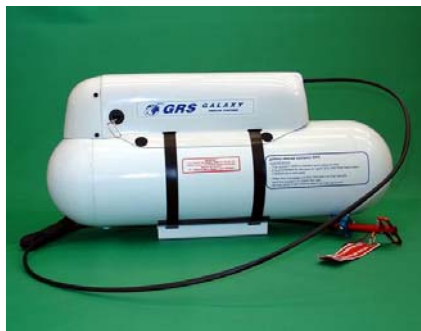
Ballistic Recovery System for light aircraft; Source: sportflyingshop.com

The solution for this problems is detachable engine pylons which after being detached could fall freely on the parachute to the surface of land. In centre of gravity of the engine pylon would be mounted a tray with component similar to available the market readymade product Ballistic Recovery System (United States Patent 4607814). The largest and most capable parachutes from BRS were originally certified on Cirrus Design’s SR20 aircraft, which was certified in October 1998 as the first aircraft to have a whole-airframe parachute system installed as standard equipment. The SR22 has a slightly different design. The canopy is deployed by a solid fuel rocket motor with manual activation. Deployment occurs within one second and canopy inflation follows rapidly. The canopy is attached to the airframe via 15,000 pound (6,800 kg) and Kevlar Bridles. The Cirrus Maximum Gross Weight is about 1542 kg and the mass of the Boeing 737 engine is about 1950 kg. So that after slight redesign BRS made for Cirrus could serve for safe bringing down engine pylon without causing any harm to people on the land