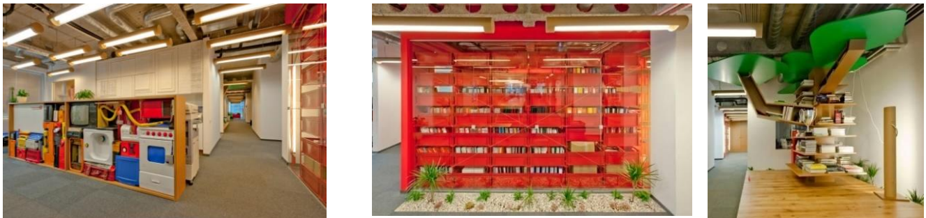
Fig. 4. The office of international advertising agency McCann Erickson - Riga,

The project played with the idea of simulating outdoor space in the interior. Different parts of the office are free standing units , buildings , among which paved walkways , streets. In the interior used recycled raw materials and economic , and the walls and tables in rooms decorated timber left over from other offices and private projects (Figure 4). The main idea risayklynhu interior features a concierge reception, which consists of electrical appliances and household items that have long had bits in a landfill . [3]