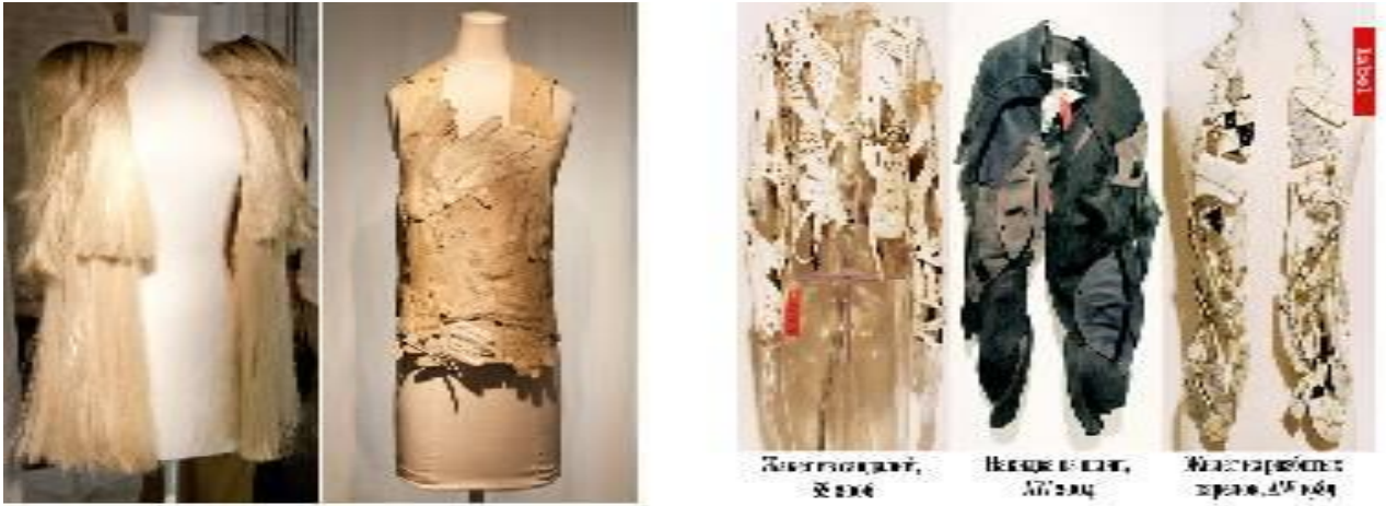
Fig. 3. Top of gloves, hats and jackets with broken plates