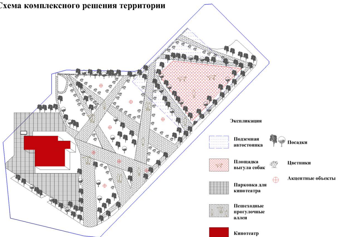
Fig. 4. Scheme of complex solutions territory

Conclusions . As a result of analysis, identify problems, create a design program has been proposed a set of measures for landscaping around the cinema "