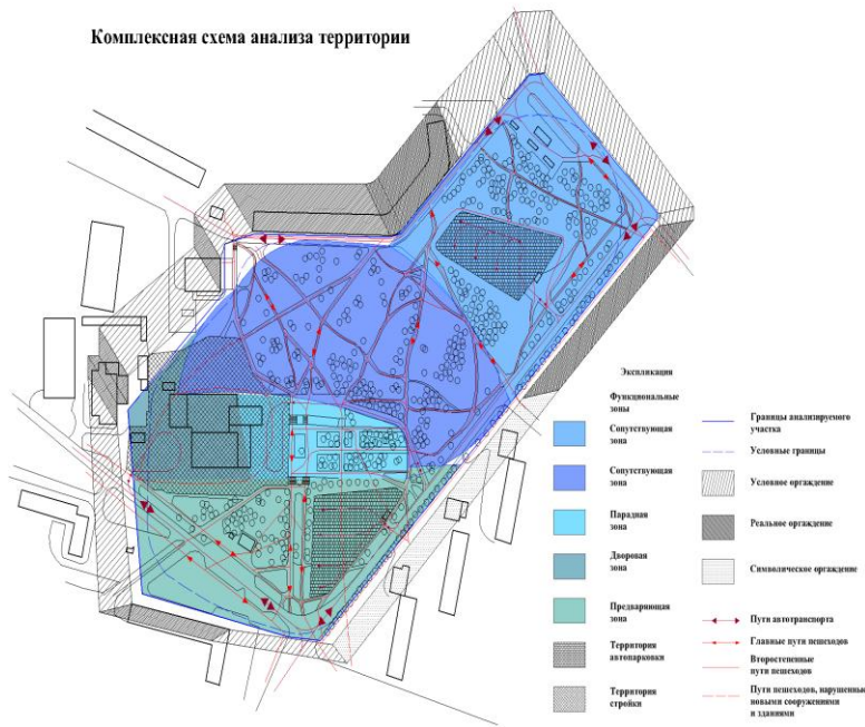
Figure 1. Integrated circuit analysis area

environment, which also corresponds to the space category II .