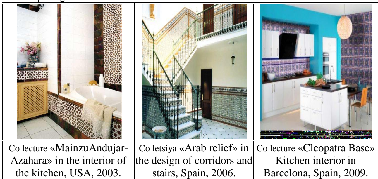
Figure 1. Ceramic tile with oriental ornament in interior spaces.

According to the canons of the Eastern countries, namely Sunnis (the direction of Islam, unlike the Shia, they have no right to use its own decisions in matters of religious and social life), pictures of people and animals are not allowed. The reason for this fact is the features of religion, where images of portraits and figures of people are comparing themselves with God and considered taboo.