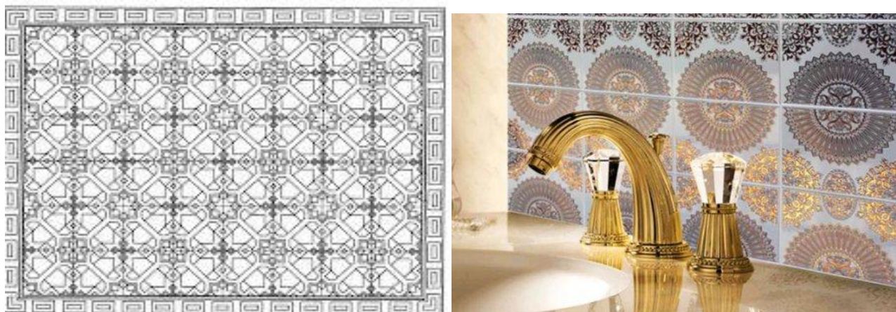
Figure 3 Rapport Ornament (part of a pattern that is repeated many times)

Ornament on a large number of ceramic tiles allows creating rapport, repeated an infinite number of times (Fig. 3). The basis of the Arabian ornaments placed hexagon regular shape, which in turn is formed from the intertwining of two equilateral triangles.