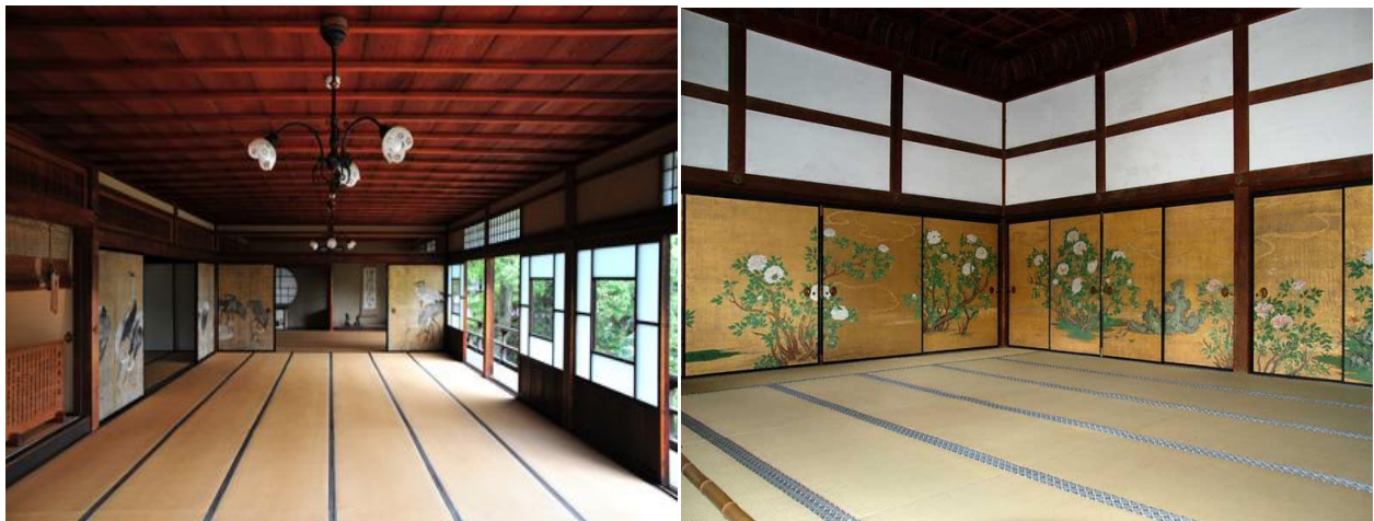
Ill.. 3. Demonstration of voids in the interior of the Japanese housing

All this is reflected in the organization of living space, a void which is a consequence of both philosophical and ritual factors (III.3).