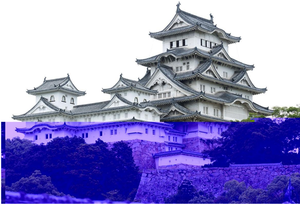
Ill.4. Hymedzi Castle (White Heron)

Isolate exterior features: available location, severity on a background environment (river or plain) that highlights and color of the walls (white or dark), as irresistible silhouette of the castle rock, as a sign of self-sufficiency symmetry, asymmetry and smooth lines as a sign of dynamism and willingness to change.