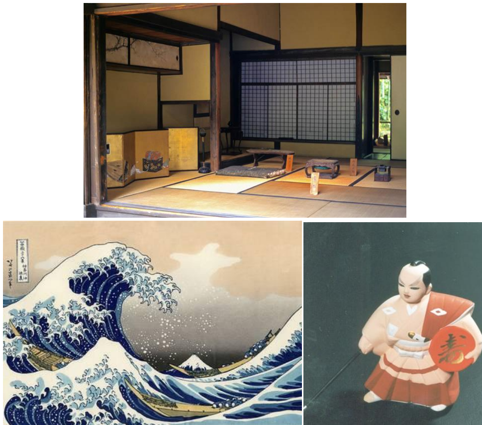
Ill.7. Elements of interior

Reticence impression created by the lack of symmetry, shape, matching pictures, old stock items that obsolete of time and covered with mesh cracks. In colours dominated natural tonnes of rice paper, water lilies, bamboo, birch, cherry. Pink and brown, black and white tones are used for contrast. The colour of the walls and ceilings designed in matte and pastel colours that contrast with the tones of the furniture or prints. Also used puppets, paper lanterns, plants, military paraphernalia (Ill.7).