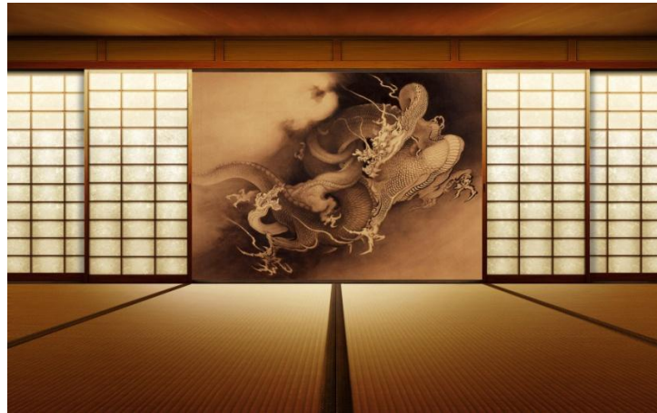
Ill.5. Using partitions, screens, sliding doors for transformation of interior space

Another is the level of impacts and reactions corresponding properties transform housing. Employee time all external forms and signs conquest of the process space law is well aware the soldiers, philosophers, poets.