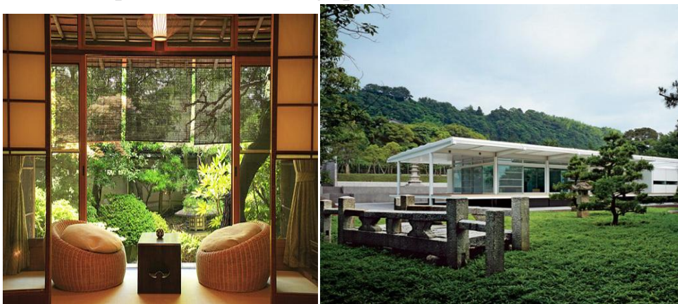
Ill.6 Garden and house

The organization of space-time is based on the provisions specific to higher levels, and the expense items that have distinct localization of these categories. Let us follow the example of this ties living space with inner circle ( Ill.6 ).