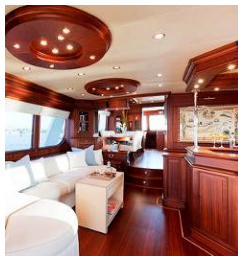
“VICEM 96 CRUISER” VicemYachts. Turkey 2014.[8]