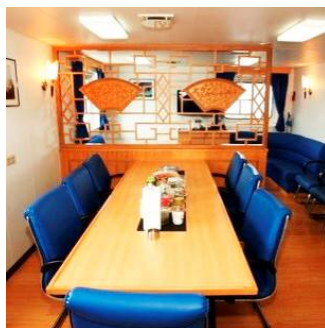
“HHL VALPARAISO”. Hansa Heavy Lift. Monrovia 2010.[11]