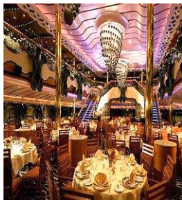
“Carnival Splendor”. Carnival Cruise Lines Company. Italy. 2008.[6]

Image analysis showed that cruise ships are characterized by three color palettes, which are often used: beige-brown – 64%, burgundy-red – 22% and “sea wave” colors – 14% (Fig.1).