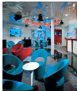
“Carnival Glory”. Carnival Cruise Lines Company. Italy. 2006.[6]