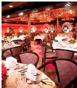
“Carnival Ecstasy”. Carnival Cruise Lines Company. Finland. 1991.[6]