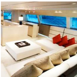
“RedDragon”. WilmotteAssociates. New Zeland 2008.[7]

Image analysis showed that in yacht interiors are tending to choose such colors: brown – 23%, beige – 28%, white – 43% and gray 15% (Fig.2).