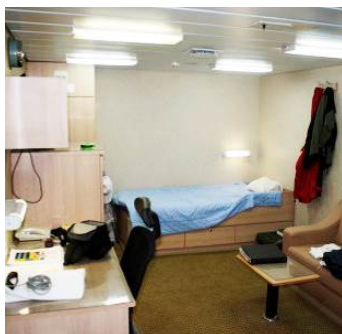
“LARISSA”. Company R/V Araon. South Korea 2010.[10]

Interiors for cargo ships made with reference to save space (Fig.3).