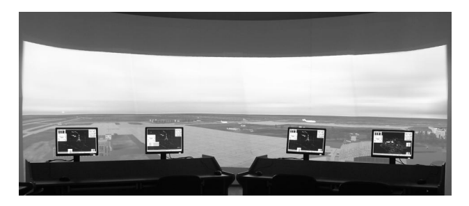
Fig. 2. 3D view of manoeuvring area of aerodrome

The Simulator complex "Control" includes the 3D view of an manoeuvring area of aerodrome (Fig. 2), which is used by the modules of the Integrated SMS in ATS for the initial, visual survey of hazards and risks on aerodrome and in the vicinity of aerodrome.