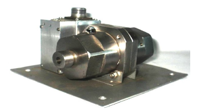
Fig. 2. The exterior differential manometer

the membranes that provides improved of linearity characteristics in the values \Delta p , close to zero, and reducing of a hysteresis of membranes. The collected part is included in the measurement circuit being completed "zero" nut 10 is sealed, then welling buildings of foster chambers and nozzles lead to measurable pressure pipelines. (Fig. 2).