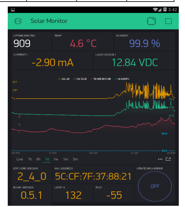
Fig. 4. Our solar tracking system with Blynk cloud application

This system basically monitors a simple charge controller that is fed from a couple of solar panels wired in parallel. The App runs 24/7 and gives me updates on charge rate, battery voltage, outside temperature and a history graph of the whole thing so i can look back a recollect how sunny it was.